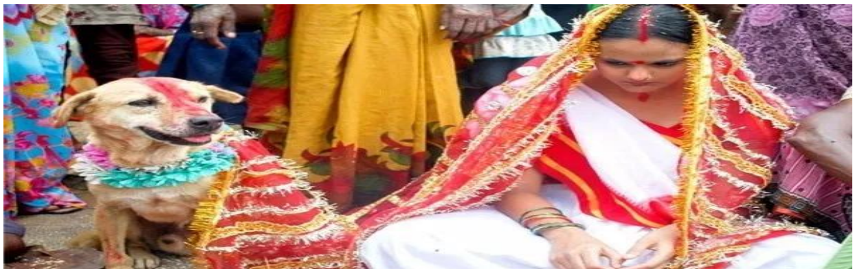
woman marrying dog (making woman equal to dog)

Among certain sections of the Indian villages, there is a strong belief and faith that marrying animals would appease the Rain God and bring rain. Women with 'Mangal Dosh', natural deformity, cleft tooth are considered to be possessed by spirits. To get rid of such spirits many superstitious believers perform ritual of Human-Animal Marriage. To exorcise the ghost the possessed girl is forced to marry an animal such as a dog or a goat.