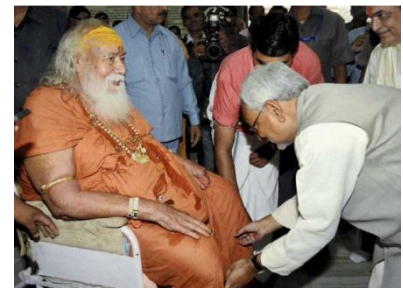
Nitish Kumar falling on feet of Brahmins (unlike jayalalitha)