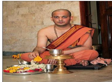
Money eating serpents in between (pricing every visit). Why is reaching God linked with money. No hardwork just sits and eat.