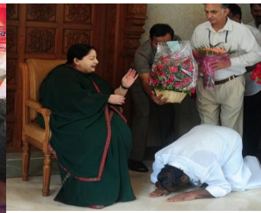
Tamils falling on feet of brahmins. (done in the garb of women empowerment calling her iron lady and some other words)