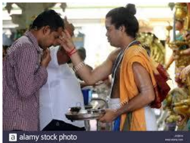
No god in scene. carrying god in their hands. They have become gods.