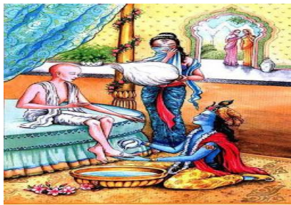
Krishna considered God as many worshippers is made to fall on feet of brahmins, (krishna is a black coloured (indian aboriginals). They have madeup stories of Gods falling on their feet.