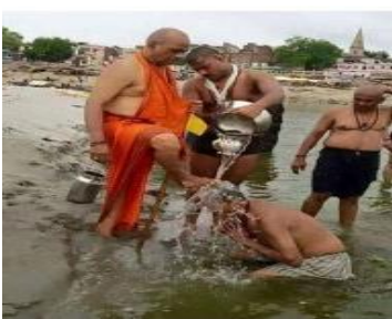
Transferred God to legs