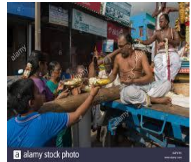
No god appears in frame