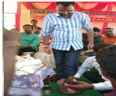
Workers washing Nishikant Dubey (MP) feet and later drank the water. (dubey or dwiedi is a brahmin)