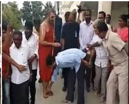
JMR falling on feet of brahman. No God at all in picture. (people fall on jayalalitha feet as she is CM). Why the reverse