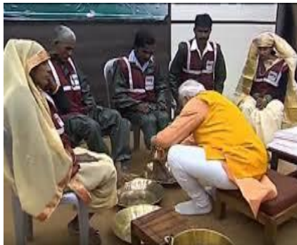
trying to stop the revolution.

No need to tag her as foreigner. She already has foreign american citizenship. All rss supporters nowadays are taking foreign citizenship. Dadabhai Naoroji's Drain of wealth is still continuing. The rss guys earn money in India and later end up in foreign country and spend money there. Making India as poor as it can get. Dumb Indians are still sleeping and fighting with each other. The brahmin menace in country shall be cleaned.