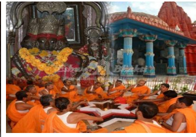
Brahmins (foreigners) only puja.