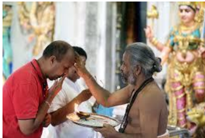
Devotees taking blessings from pujaari rather than god. The transformation is brahmin to God and Goddess to namesake figure. There is no direct contact between Goddess and devotee.

India was able to remove middle men from almost all the areas of corruption. India has been through a slew of reforms since independence. Middle men were removed from agriculture, commercial market and many other areas of economy. The spiritual middle men were oversighted due to fear of God. The brahmins have used God for their benefit to terrorise people. Every wrong they do has been covered up by piousness cover. Killing a person and raping a woman by brahmin are all providenced by God for their benefit. Indians are falling on feet of foreign brahmins. Non-brahmins have been distanced from God. Brahmins acting like they are bringing something from god and slowly started acting like God.